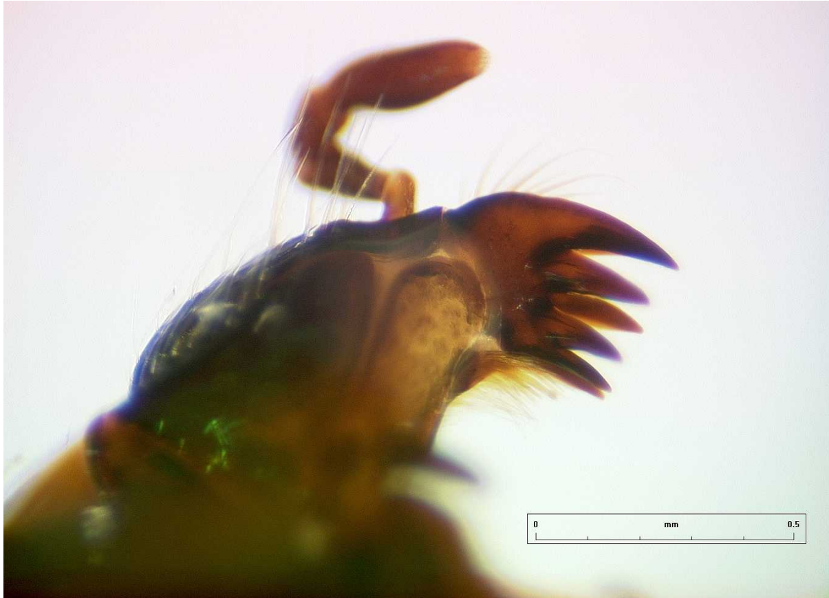
Web Fig. 8 : Lacinia with more than 2 teeth