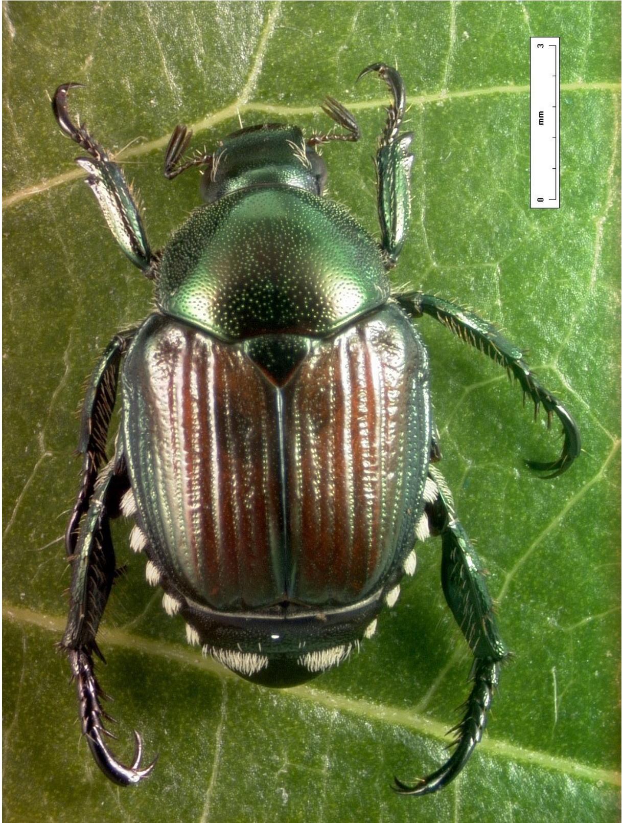
Web Fig.3: Habitus (male).