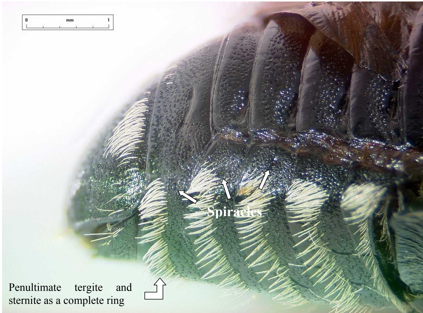
Web Fig. 6 : Abdomen, lateral view