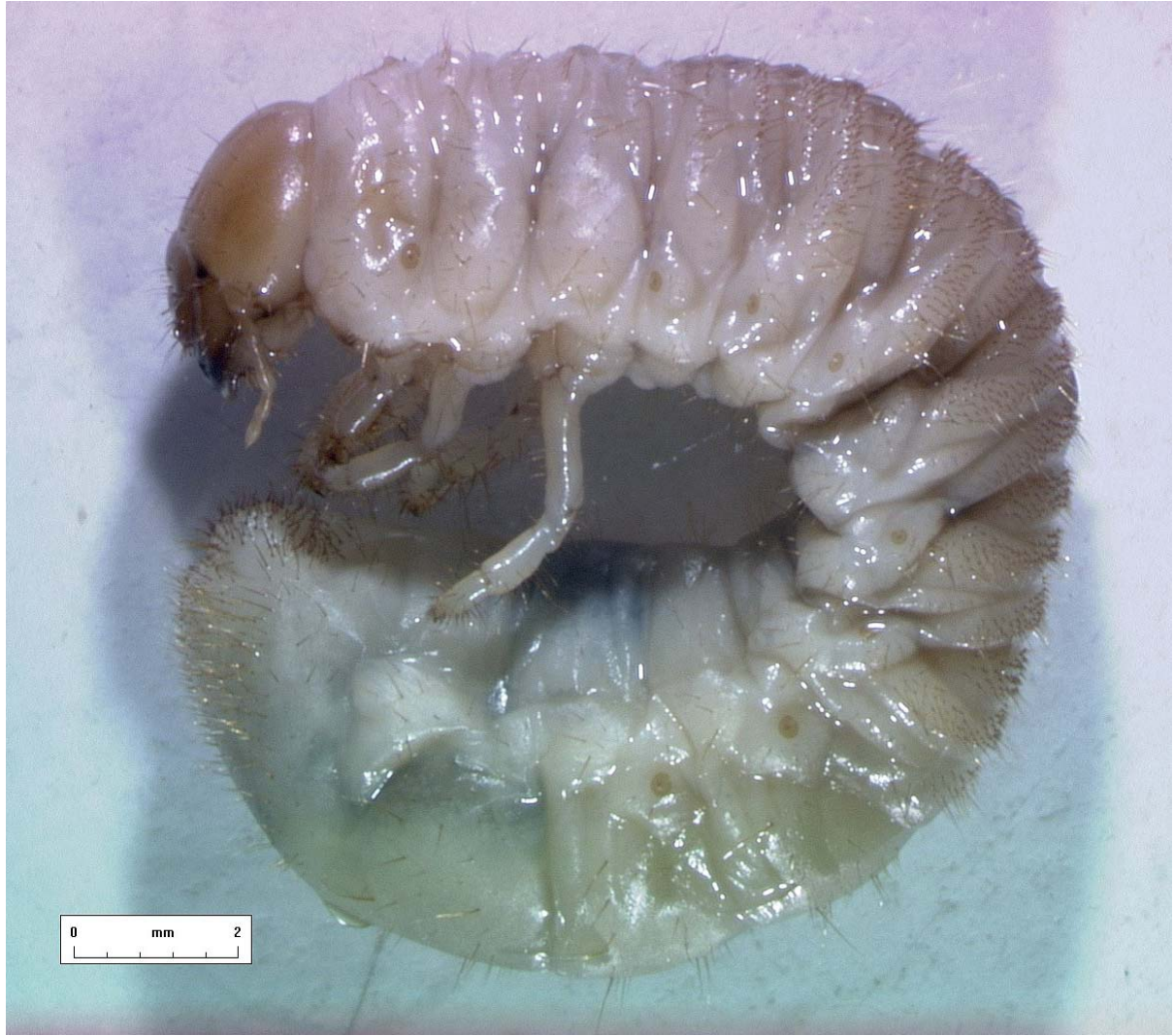
Web Fig.1: Third instar larvae.