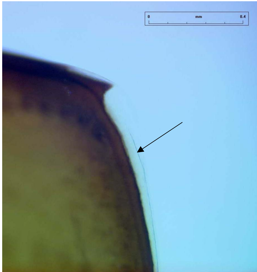
Web Fig. 7 : Elytra, membranous border of lateral margin