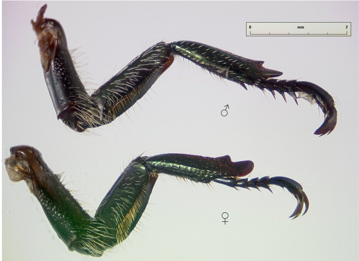
Web Fig.4: Protibial aspect, male pointed, female rounded