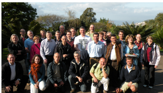
EPPO Panel on Quarantine Pests for Forestry

EPPO's technical activities are directed by two Working Parties (on Phytosanitary Regulations, and on Plant Protection Products). Their respective programmes cover: limiting the spread of pests between countries (broadly plant quarantine) and harmonizing activities on plant protection products within countries. Each Working Party meets once a year. The meetings are held in member countries throughout the EPPO region.