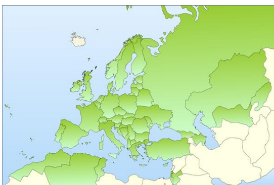
Current EPPO member countries are shown in green

The European and Mediterranean Plant Protection Organization (EPPO) is an intergovernmental organization responsible for international cooperation in Europe, and supporting the Member Governments in ensuring plant health in the EPPO Region. In the sense of the article IX of the International Plant Protection Convention (IPPC), it is the Regional Plant Protection Organization for Europe. Founded in 1951 with 15 member governments, it now has 52 member governments including nearly every country in Europe, as well as countries in the Mediterranean region and Central Asia.