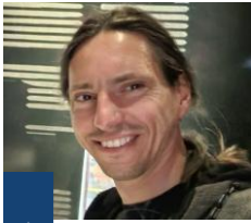
Nederlandse Voedsel- en Warenautoriteit Ministerie van Landbouw, Visserij, Voedselzekerheid en Natuur